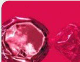
Printing & Packaging