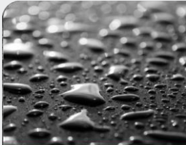
Wetting Agents & Surface Modifiers