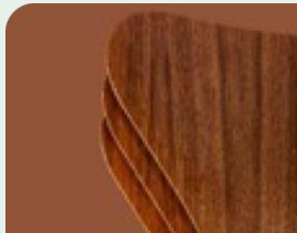
Furniture & Flooring